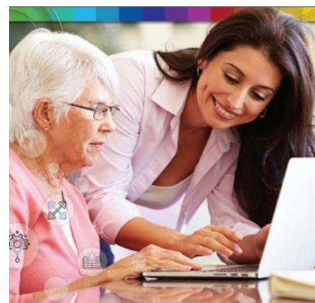
Network Patient Representative Handbook